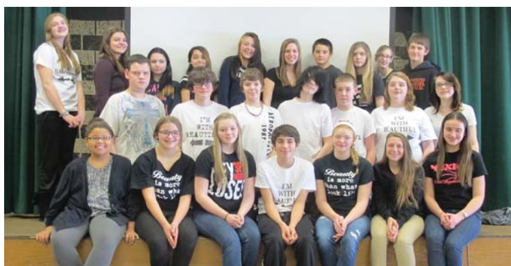
Eighth grade students.

True Beauty Day 2015 was held at Mexico High School and Mexico Middle School on Thursday, February 5, with upwards of 400 students in the high school and approximately 120 in the middle school, as well as numerous faculty and staff, participating. The focus of the day was the message that beauty is more than what one looks like. Girls wore no make-up for a day, and positive character traits were highlighted with various activities.