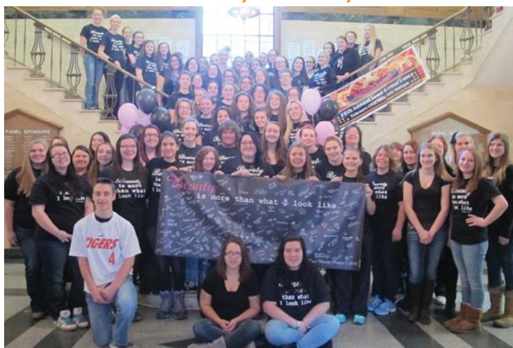
Mexico High School students on True Beauty Day 2015.

True Beauty Day 2015 was held at Mexico High School and Mexico Middle School on Thursday, February 5, with upwards of 400 students in the high school and approximately 120 in the middle school, as well as numerous faculty and staff, participating. The focus of the day was the message that beauty is more than what one looks like. Girls wore no make-up for a day, and positive character traits were highlighted with various activities.