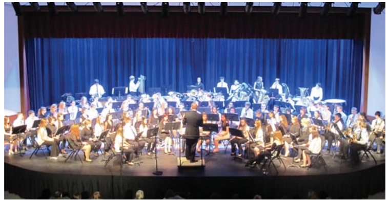
All-County Junior High School Band