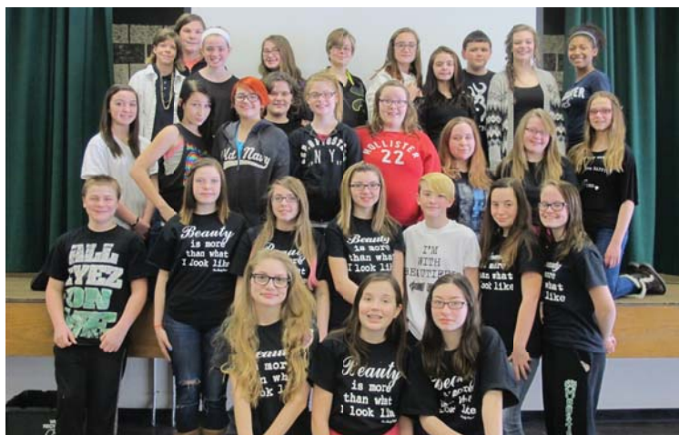
Seventh grade students.