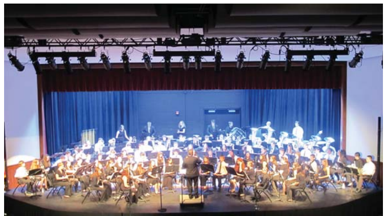
All-County Senior High School Band.